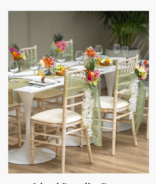
Island Paradise Decor