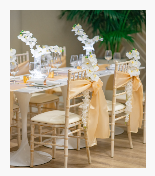
Orchid Dream Decor