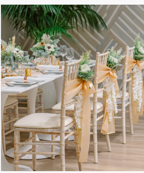
Enchanting Garden Decor